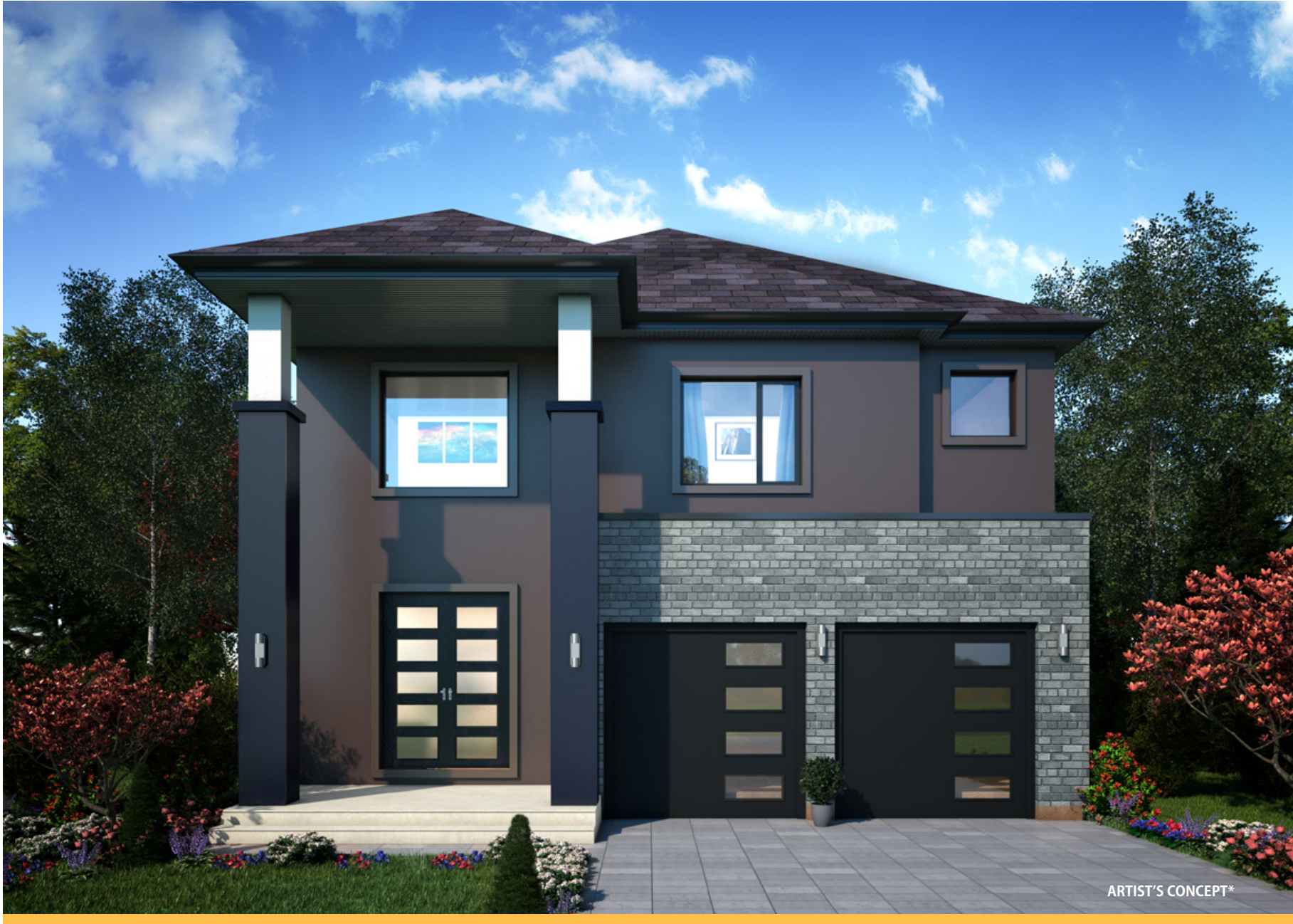
THE NIMRIT VILLA ELEVATION `A'